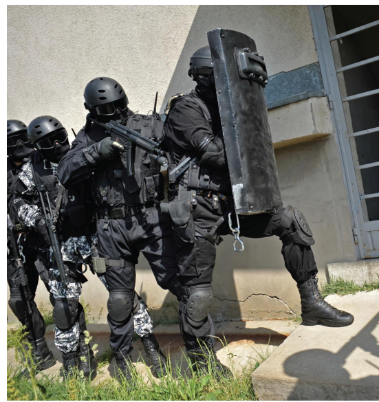
The SS8000 is designed for SWAT, Special Task Forces, to capture audio

The FOM is built around a tiny MEMS membrane and two optical fibers. When acoustic waves impinge on the membrane they cause it to vibrate, changing the intensity of light that is reflected from incoming to outgoing fibers. Such precision translates to clear sound and low self-noise, and produces exceptional microphone performance.