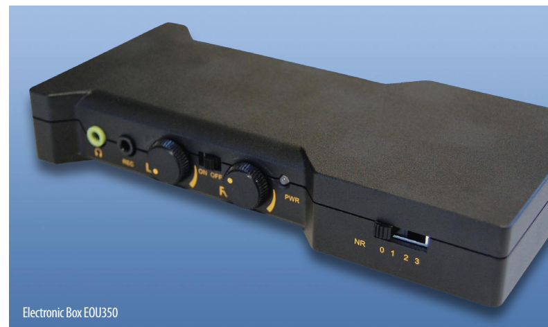
Electronic Box E0U350